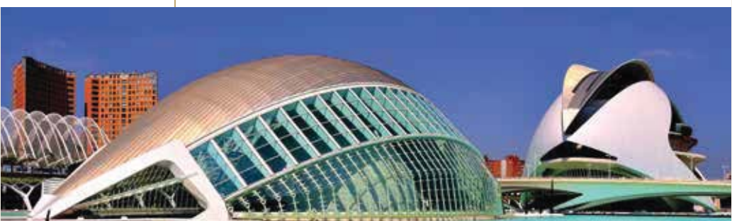
City of Arts and Sciences, Valencia

Oceania Cruises may modify the cruise itinerary up to and during the voyage. Air arrangements, cruise accommodations, local transportation, and optional shore excursions are arranged by Oceania Cruises, which may use other suppliers or providers to render the services. The agreement in this brochure is the exclusive and entire statement of the agreement between you and Go Next, Inc. It should be read carefully.